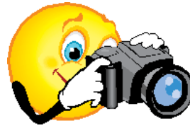
PHOTO RELEASE - All participants and their parents have read and agree to this policy: I understand that by attending this program, sponsored by the Northern NJ Council, Boy Scouts of America, I consent to the use of photographs, film, videotapes, electronic representations and/or sound recordings made of me during that time by the Boy Scouts of America, at their discretion, and I hereby release the Boy Scouts of America from any and all liability from such use and publication.

To properly advertise this Camporee and all future events, we are asking that each unit have the following information put on their permission slips (if they are not using the "Activity Consent Form"):